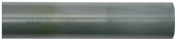
Ceramic outer tube

A combination of high temperature and salt deposit causes a quartz torch to devitrify. Higher concentrations of salt in the samples lead to more rapid devitrification. The quartz torch in the photo was run for only 6 hours with samples containing 10% NaCl and is already badly degraded. By contrast, the ceramic material does not devitrify and is not affected by salt deposits.